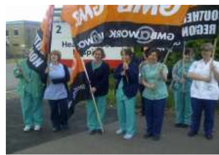
Here are only a few of the many photos received from our regions.